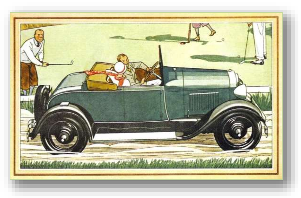
"Out with your sweetie on a Valentine's Day jaunt."