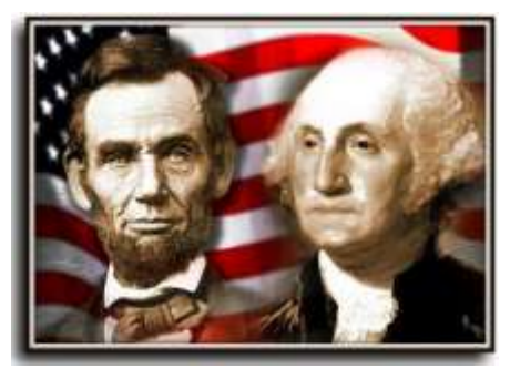
PRESIDENTS DAY - FEBRUARY 18